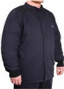
ATPV 55 CAL (Jacket)

ATPV 55 CAL (Ventilated Hood also an option)