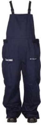
ATPV 55 CAL (Trousers)