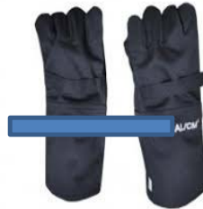
ATPV 55 CAL gloves

ATPV 55 CAL (Ventilated Hood also an option)